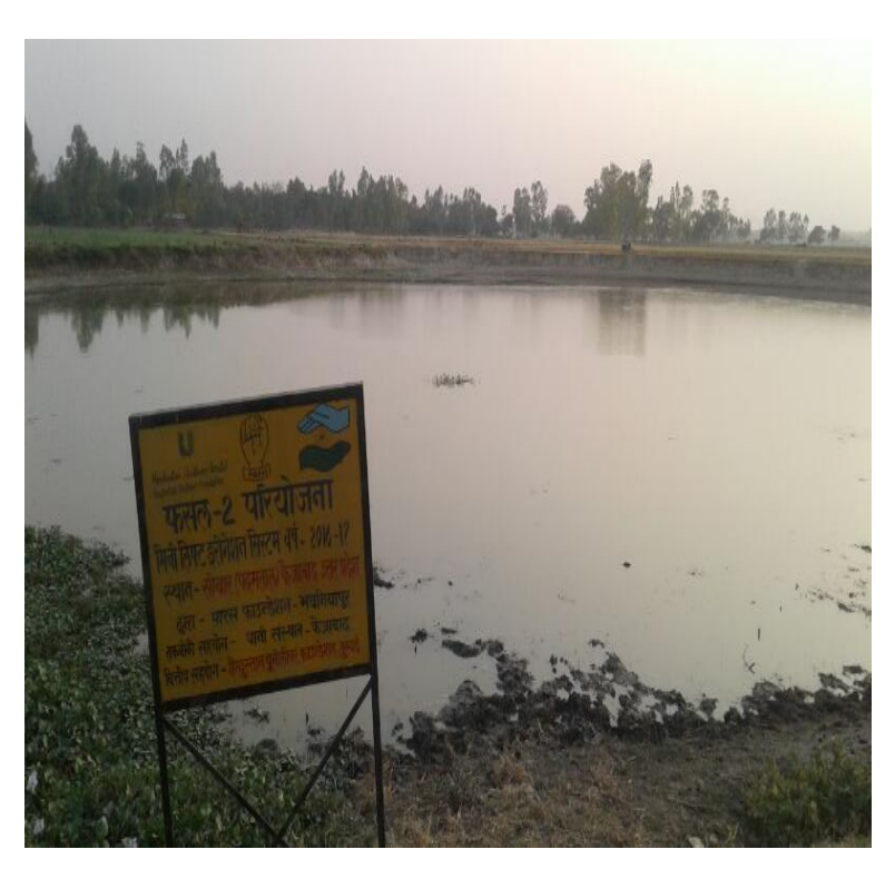
Figure 2: Pond after maintenance through intervention

Quantitative analysis reveals that because of the renovation of the ponds, a water storage capacity of 19200 cubic meters created. A considerable production (about 80 tons) is achievable through irrigation from these ponds. Additionally, the initiatives of water